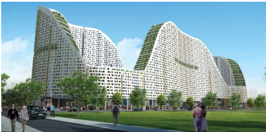
EverRich 2 © DWP Architects