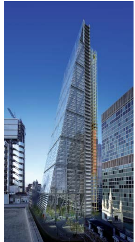
122 Leadenhall Street