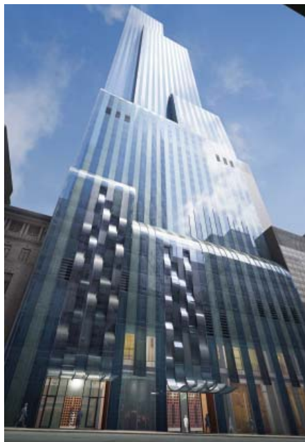
Carnegie 57 © Christian de Portzamparc

On May 7, Vietnam's Ocean Bank and Petrovietnam Construction Corporation publicly presented plans for a 102-story tower on a 25-acre area in Me Tri commune in Hanoi's outlying district of Tu Liem, Vietnam. The 528-meter (1,732-foot) tall PVN Tower is named after its main tenant PetroVietNam, being the trading name of Vietnam Oil and Gas Group. The estimated investment cost will be more than US$1 billion. Construction of the project is scheduled to begin in early 2011 and is expected to be completed within three years. The building is considered to be a future icon of the Vietnam Oil and Gas Group.