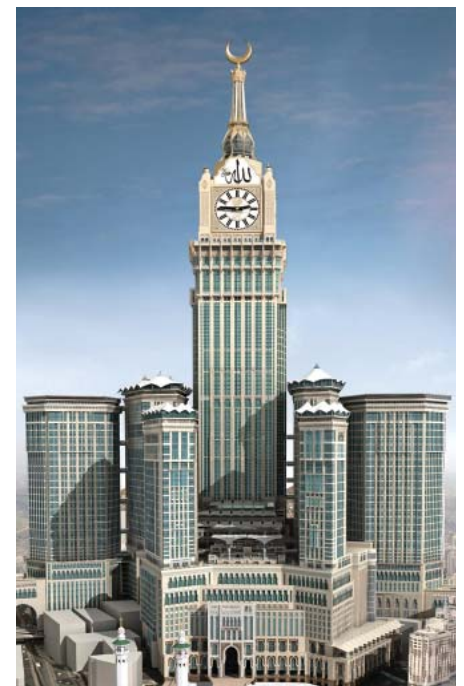
Mecca Royal Clock Hotel Tower

On August 3, the Port Authority of New York and New Jersey signed a tentative deal to move the Condé Nast headquarters to 1 World Trade Center , the 541-meter (1,776-foot) skyscraper, formerly known as Freedom Tower, is currently under construction in New York City. Introducing a high-profile tenant such as the worldwide magazine publishing company is considered a milestone in the development of New York's future tallest tower. Signing a private anchor tenant will help spur interest from other potential tenants, which may produce higher rents. ↗