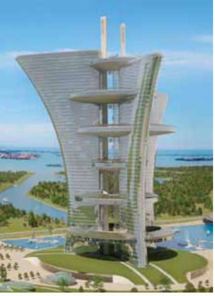
Palais Lumiere, Venice © Pierre Cardin

The design features fin-shaped towers connected by horizontal rings. "Whether or not you like it, it will be a work of great architecture and engineering," the governor said.