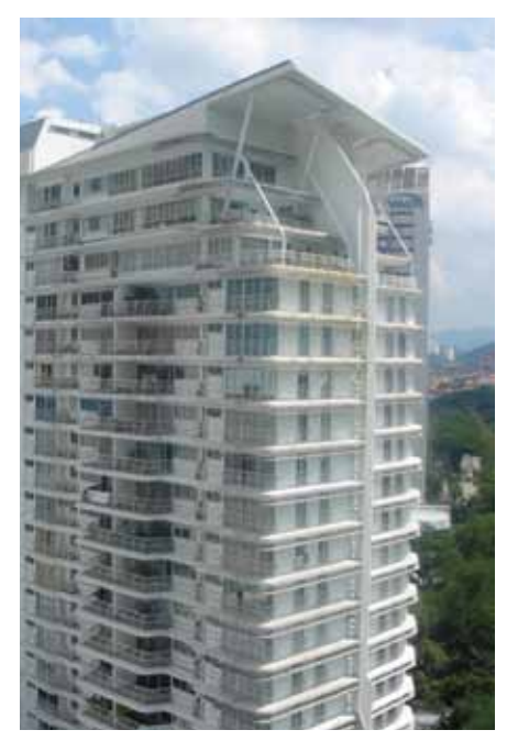
Figure 1. Taman Tun Dr. Ismail (TTDI) condominiums, Kuala Lumpur © T.R Hamzah and Yeang

ments of internal environmental conditions, namely temperature and humidity, interviews with the occupants and the assessment of energy bills. While the field work brings insight into the reality behind the various energy and thermal comfort demands of residents, it also sheds light on their adaptive behavioral response to environmental conditions and architectural features offered by principles of