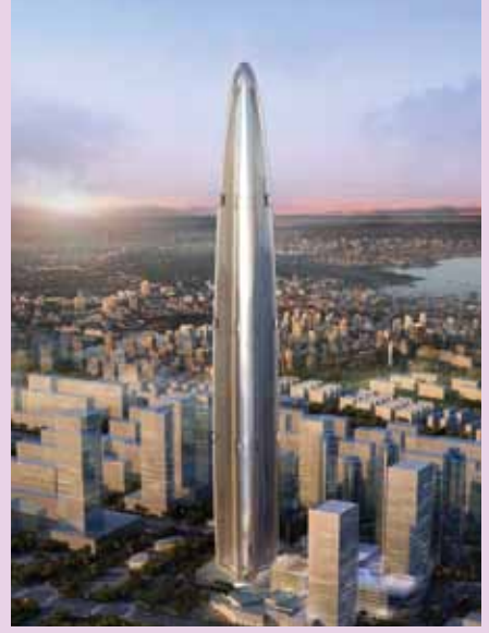
Wuhan Greenland Center

In Warsaw, BBI Development is teaming with the Roman Catholic Archdiocese of Warsaw to build a 180-meter tall office tower. The developer and the diocese formed a separate venture to build and manage the development, which has already been approved by local authorities. The tower